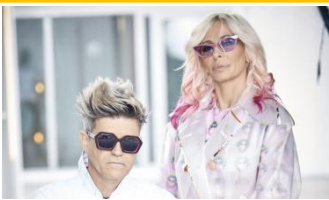
Spain Nebulossa - ZORRA